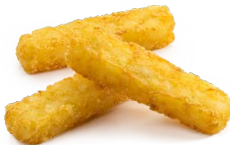
HASH BROWN STICKS 56210 41575