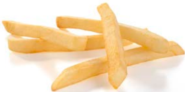
3/8" REGULAR STRAIGHT CUT, XLF 56210 30004