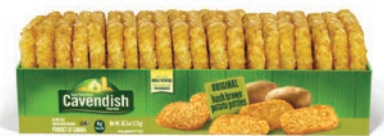
POTATO PATTIES 20-CT TRAY 56210 34217