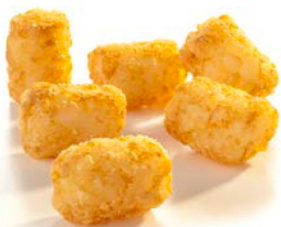
GOLDEN NUGGETS, OVENABLE 56210 04101