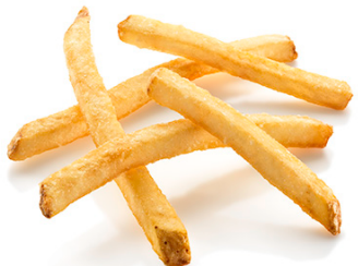
SHOESTRING, SKIN-ON 56210 05521