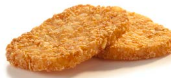
POTATO PATTIES 5-LB BAG 56210 34500