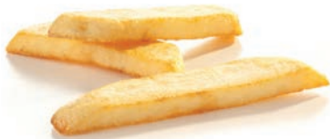
STEAK CUT 56210 34013