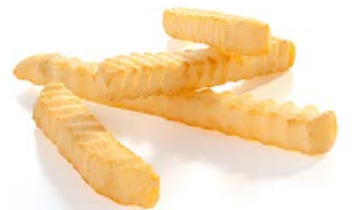
SELECT CLASSIC CRINKLE CUT 56210 34022