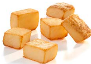
SKIN-ON BREAKFAST BROWNS 56210 30319