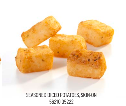
SEASONED DICED POTATOES, SKIN-ON 56210 05222