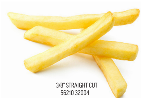
3/8" STRAIGHT CUT 56210 32004