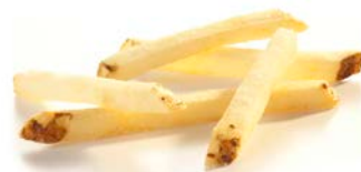
5/16" THIN CUT, SKIN-ON 56210 04501