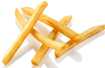
SHOESTRING, XLF 56210 34012