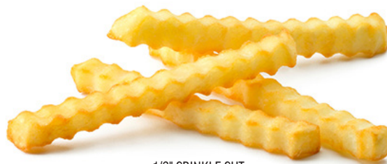
1/2" CRINKLE CUT 56210 32006