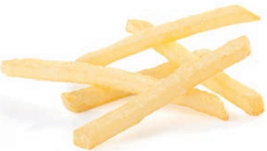
SHOESTRING 56210 05501

CAN'T BE BEAT Fine Coat XLF fries boast extra-long lengths offering maximum yields for your plates.