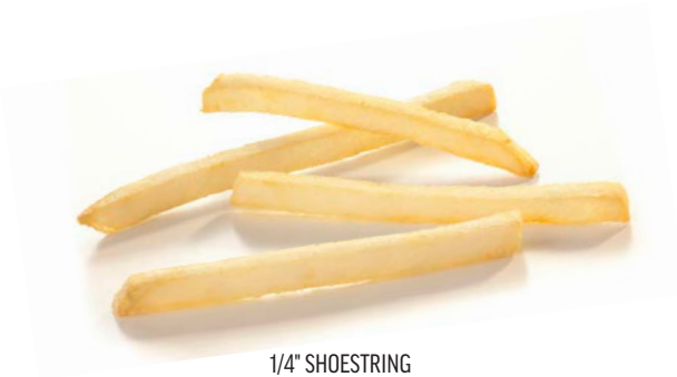
1/4" SHOESTRING 56210 32011