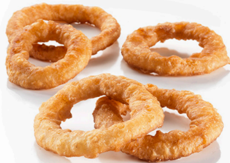
1/4" CRISPY TEMPURA ONION RINGS 56210 05363