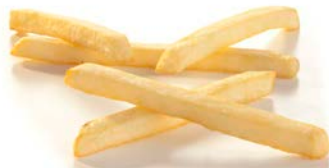
5/16" THIN, STRAIGHT CUT 56210 34001