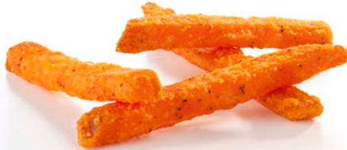
SEASONED THICK CUT SWEET POTATO FRIES, SKIN-ON 55776 00091