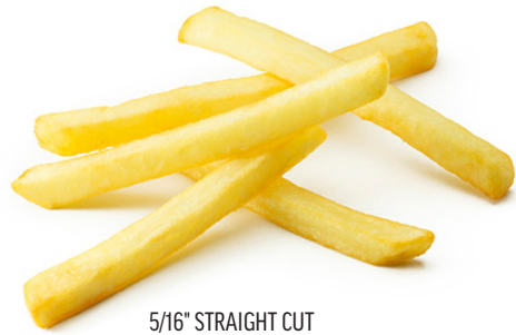
5/16" STRAIGHT CUT 56210 32012