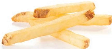
3/8" STRAIGHT CUT SKIN-ON 56210 05606 56210 05506