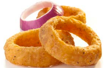
JERSEY SHORE ® SPICY RED ONION RINGS 55776 00092