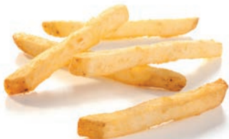
3/8" PUB FRIES™ STRAIGHT CUT, SKIN-ON 56210 05004