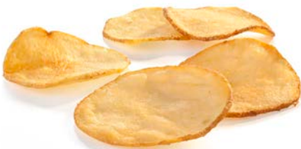
CHIPS, SKIN-ON 56210 20378

Save on the increasing costs of labor and food inflation with FreshCut French fries!