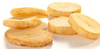
POTATO DOLLARS - REGULAR CUT 56210 04016