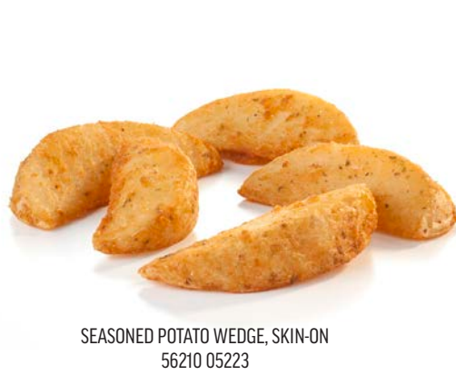
SEASONED POTATO WEDGE, SKIN-ON 56210 05223