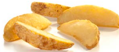
WEDGE, SKIN-ON 56210 04019