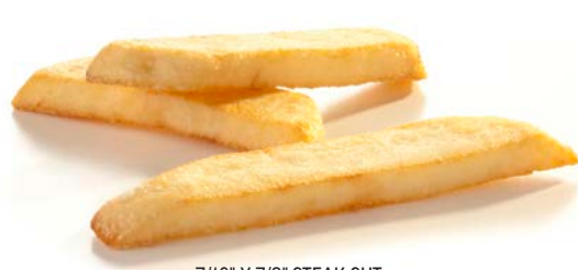
7/16" X 7/8" STEAK CUT 56210 32013