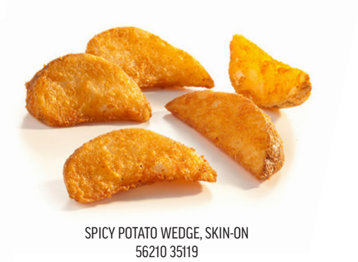
SPICY POTATO WEDGE, SKIN-ON 56210 35119