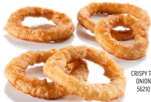
CRISPY TEMPURA ONION RINGS 56210 05363