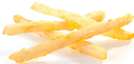
SHOESTRING 56210 05311 56210 05611