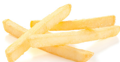
5/16" THIN CUT 56210 05503 56210 05603