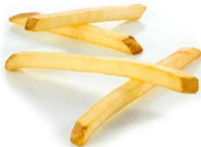
5/16" THIN STRAIGHT CUT, SKIN-ON, BRINED, XLF 56210 30124