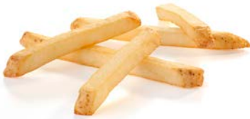
3/8" STRAIGHT CUT, SKIN-ON, BRINED, XLF 56210 30122