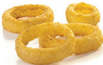
1/2" CRISPY TEMPURA ONION RINGS 56210 15120