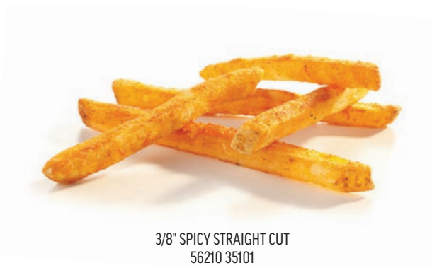
3/8" SPICY STRAIGHT CUT 56210 35101