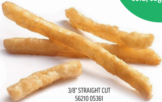
3/8" STRAIGHT CUT 56210 05361

Ask your sales rep about the CrispToGo Challenge!