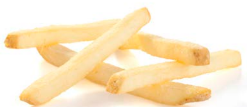
5/16" THIN CUT, SKIN-ON 56210 05505