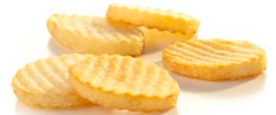
POTATO DOLLARS - CRINKLE SLICES 56210 04014