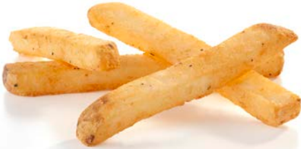
SEASONED THICK CUT FRIES, SKIN-ON 55776 00090

Big on flavor and on crunch, Jersey Shore ® products are coated in a signature garlic, sea salt, and cracked black pepper batter which makes them perfect as savory sides or irresistible appetizers. Made with premium, skin-on potatoes, select sweet potatoes and red onions, they're cut thick to offer an unbeatable dining experience. These products are a real fan favorite!