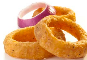
JERSEY SHORE® SPICY RED ONION RINGS 55776 00092