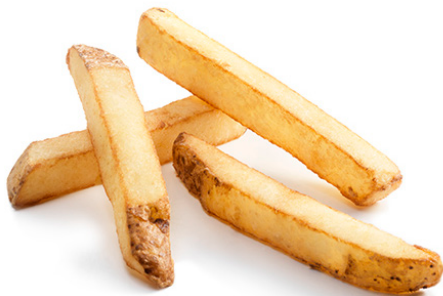
1/2" RUSSET, STRAIGHT CUT SKIN-ON, SEA SALT 56210 04562