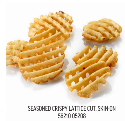
SEASONED CRISPY LATTICE CUT, SKIN-ON 56210 05208