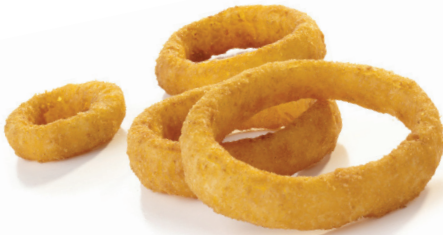
1/2" CRISPY BEER-FLAVORED ONION RINGS 56210 15450