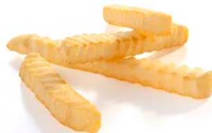
1/2" CRINKLE CUT, XLF 56210 30006