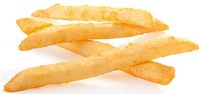
3/8" STRAIGHT CUT 56210 05301 56210 05307** 56210 05601

Golden fries with a buttery texture – Clear Coat products offer a classic French fry taste to suit any menu and any craving. Our crispy Clear Coat coating ensures these fries provide an unbeatable taste every time.