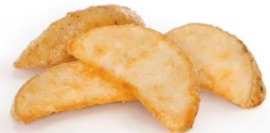
POTATO WEDGE, SKIN-ON 56210 05225