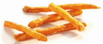
3/8" SWEET POTATO FRIES, STRAIGHT CUT 56210 20812