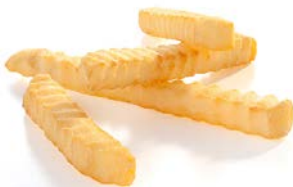
SELECT CRINKLE CUT 56210 34023