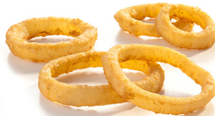
1/4" CRISPY TEMPURA ONION RINGS 56210 15100 - 1 X 2 KG 56210 15105 - 1 X 4 KG 56210 15303 - 60 X 4 OZ FAST PACK™ 56210 15110 - 4 X 60 OZ FAST PACK™