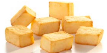
SMALL DICED POTATOES 56210 04119