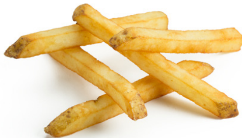
5/16" RUSSET, STRAIGHT CUT SKIN-ON, SEA SALT 56210 04550