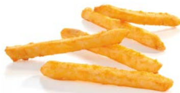
3/8" PUB FRIES™ STRAIGHT CUT, EXTRA CRUNCH 56210 55185