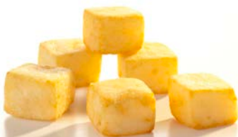
LARGE DICED POTATOES 56210 04109