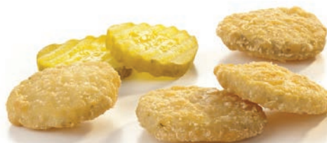
CRISPY TEMPURA PICKLE CHIPS 56210 17147